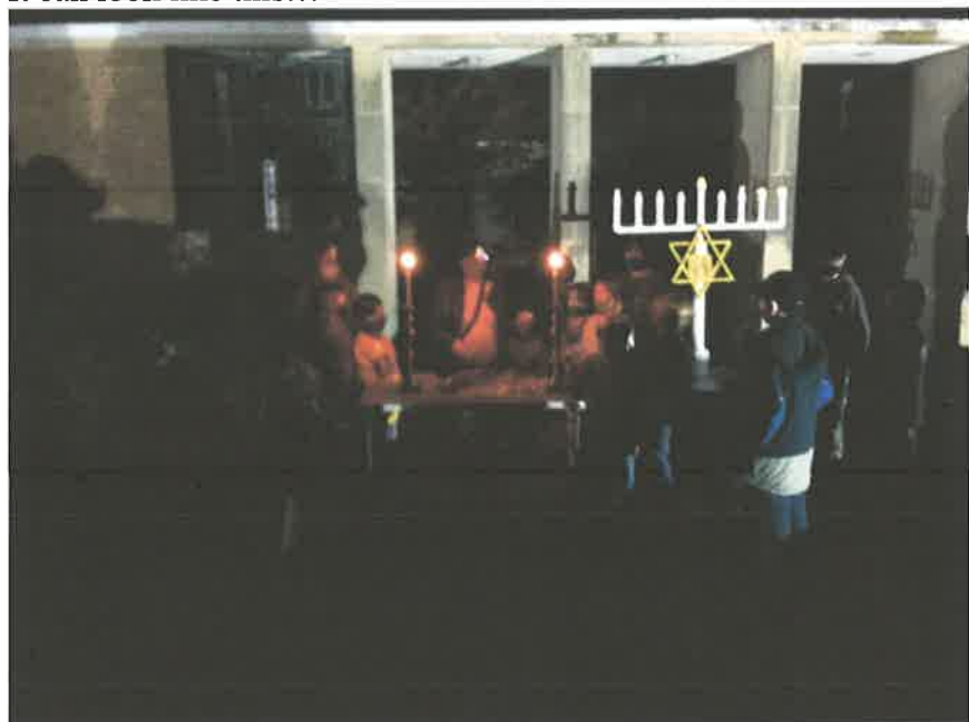
Menorah Lighting at Temple Israel (Wildwood Avenue)