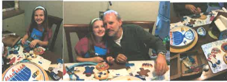
Temple Israel Religious School (TIRS) Hanukkah Cookie Decorating Competition

How do we start a movement or keep the momentum?